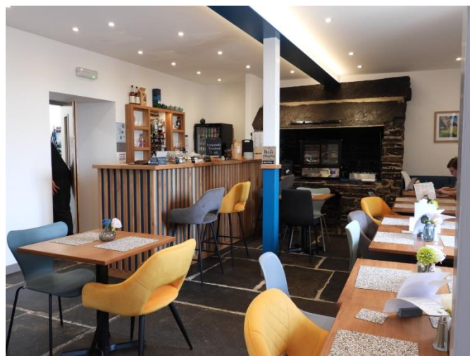
Inside the Café with the new bar