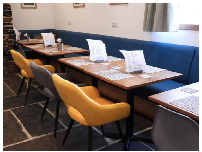
Banquet seating lines one wall