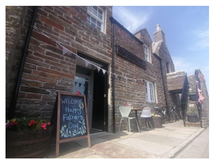
The outside has had a bit of facelift