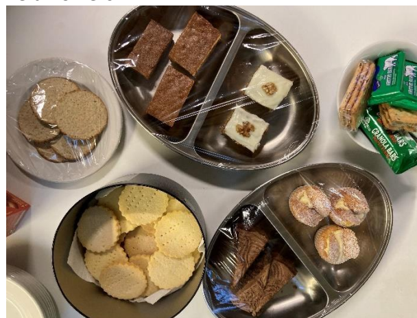
Some of the goodies available at some Winter Weekday events