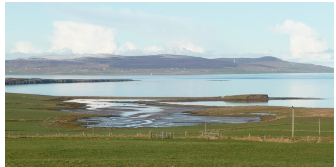
The Shapinsay Ouse

The best place to go bird watching in Shapinsay during the winter months is to take a walk down to the Ouse. You can easily take the track down sign posted to Odin. The word Ouse really just means water, and the Shapinsay Ouse is a tidal estuary where the sea floods in and out twice per day. The Ouse is bounded and cut off from the sea by a series of storm beaches known in Orkney as ayres. The tide comes in and out through a very narrow channel, just a bit too wide to jump across, between the ayres about the middle of the picture, but not visible until you get down there.