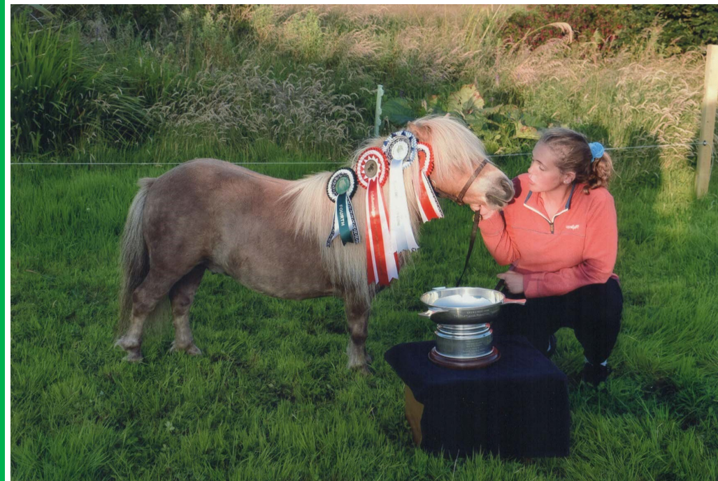
Miniture Shetland Gelding Glenfall Tickety Boo

Winner National Shetland Show in Lerwick